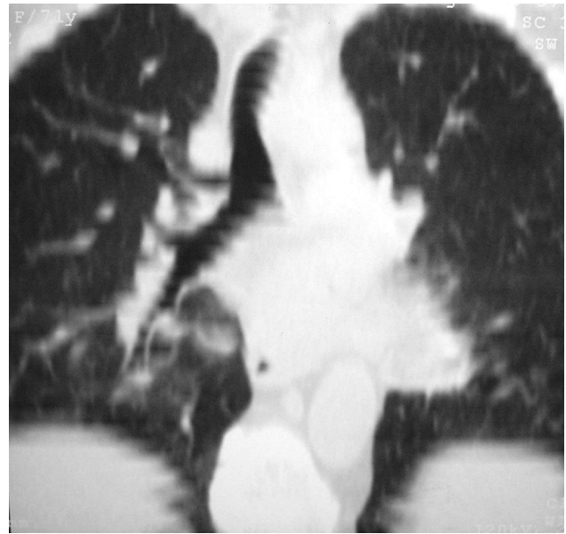
Fig. 3. Frontal-view reconstruction tomogram of the tracheal bronchus.

the pleura of the upper lobe. It can have its own vascular supply, which can be from the systemic or the pulmonary artery system. 8