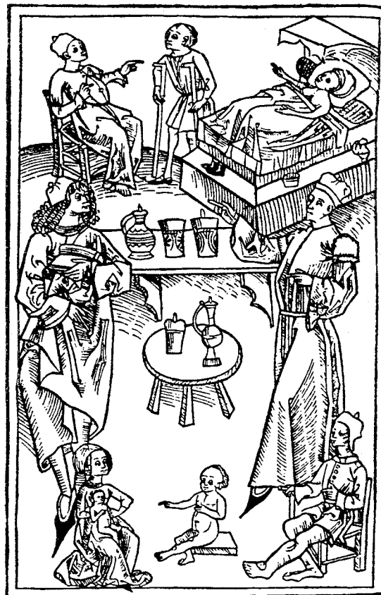
Bedside Teaching in Scholastic Times. From Hortus Sanitatis , Mainz, 1485.