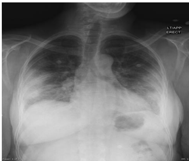
Fig. 1. Chest x-ray showing bilateral peripheral air-space disease.