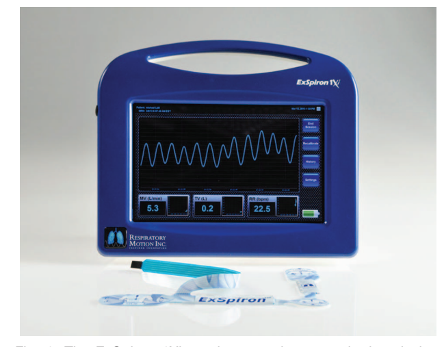
Fig. 1. The ExSpiron 1Xi respiratory volume monitoring device.