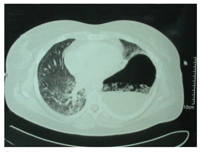
Fig. 4. Axial computed tomography scan shows mild mediastinal shift to the right and a positive dependent viscera sign.

< 2.7% are detected during the first 4 months after injury.<sup>2,3</sup> Diaphragmatic rupture is more common in the left side because the liver protects the right hemidiaphragm. Only 13% of traumatic diaphragmatic hernias are rightsided.<sup>4</sup> Bilateral injuries are not usual (2–6% of total cases). Ruptures are typically located in the posterolateral aspect