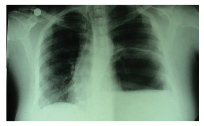
Fig. 1. Left-sided cavity with air-fluid level.