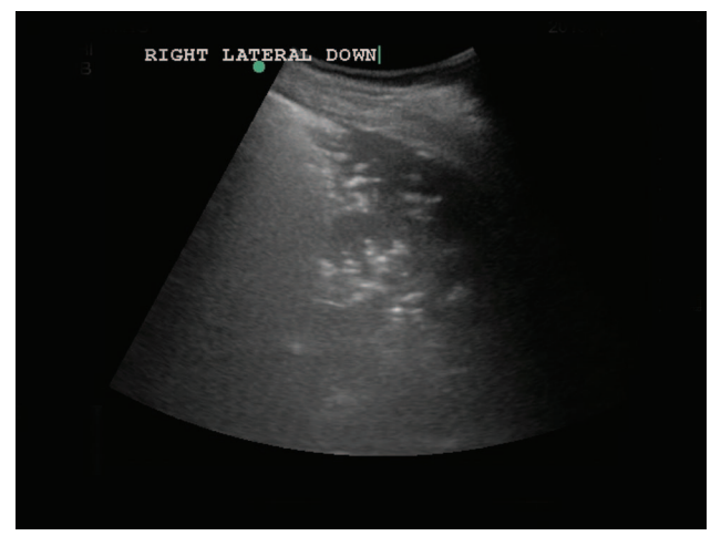
Fig. 2. Lung consolidation using ultrasound.

replaced by recruited lung tissue (Fig. 3D). Subsequently, the PEEP was decreased and maintained at 20 \text{ cm H}_2\text{O} .