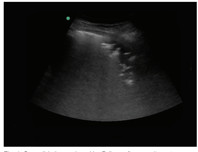
Fig. 4. Consolidation replaced by B-lines after recruitment maneuver.

Two similar cases were reported by Gardelli et al<sup>5</sup> and Santuz et al.<sup>6</sup> Neither demonstrated how to evaluate the re-aeration quantitatively. Quantitative measurement is based on changes in areas of lung consolidation. Stefanidis et al<sup>7</sup> performed the lung recruitment maneuver on 10 subjects who presented with lung consolidation. They observed the area of consolidation before (PEEP = 5 cm H<sub>2</sub>O) and after (PEEP = 15 cm H<sub>2</sub>O) the maneuver with ultrasound to evaluate the re-aeration effect of the recruitment. The authors demonstrated a correlation between the ultrasound image and change in blood gas. This supports the practical use of ultrasound to view lung consolidation in