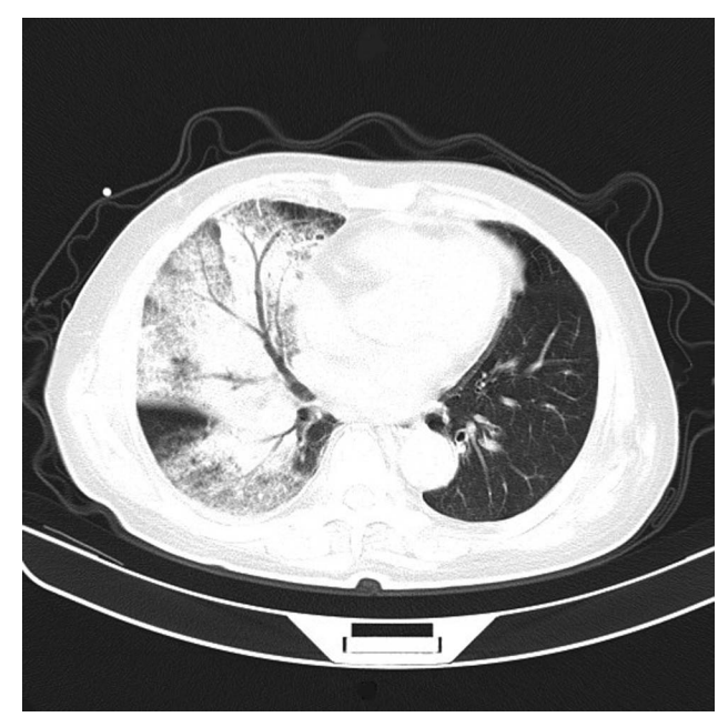
Fig. 1. Chest computed tomography 2 d after admission.

and continuous renal replacement therapy were started along with hemodynamic monitoring. The arterial blood gas on April 17, 2013, showed a P_{aO_2} of 69 mm Hg and P_{aO_2}/F_{IO_2} of 76 mm Hg with an F_{IO_2} under 0.90.