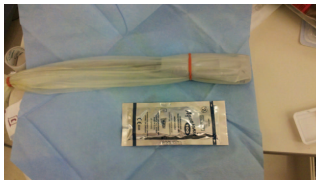
Fig. 4. Example of sterile probe cover prepped for use.

For radial artery catheter insertion, the Centers for Disease Control and Prevention recommends barrier precautions that include a hat and mask, skin preparation with 2% chlorhexidine, and an adequate sterile field over the insertion site. 3 A sterile probe cover is required when using ultrasound for catheter insertion. An appropriate probe cover encloses the probe itself and the majority of the