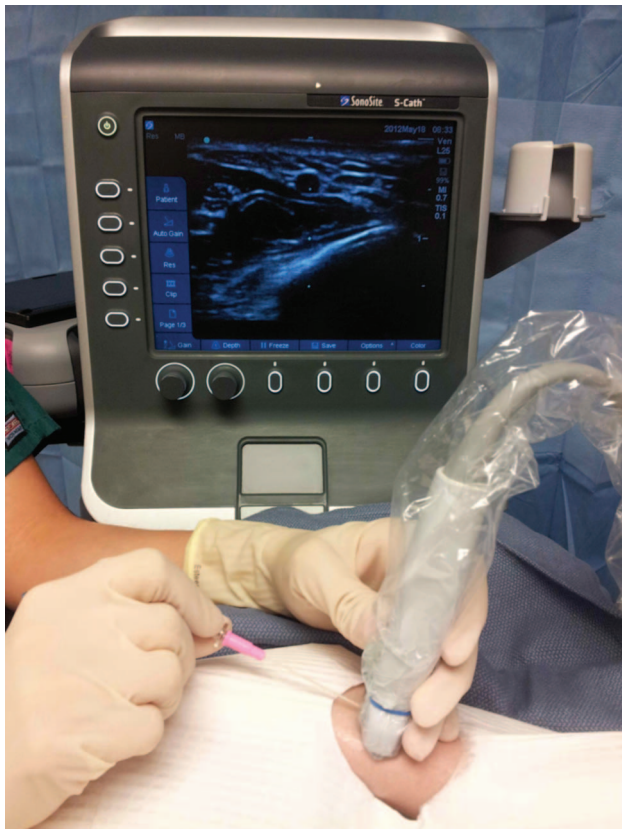
Fig. 2. Transverse view of radial artery. The arrow on the probe corresponds to the guide on the screen of the ultrasound machine; each mark on the guide corresponds to 1 cm of distance.