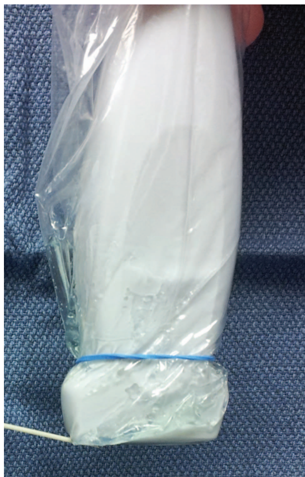
Fig. 1. Example of an ultrasound probe prepped for use.

In our institution, RTs certified in radial artery catheter placement complete a bedside training session lasting approximately 30 min while being proctored by an emergency medicine physician or RT trained in ultrasound-guided arterial catheter placement. The training session includes: ultrasound machine operation, identification of the radial artery, demonstration of the transverse and longitudinal methods, proper sterile technique, and proper left-hand technique to prevent probe movement during attempts. RTs are encouraged to perform arterial puncture with ultrasound guidance and to observe central venous catheter placement or peripheral intravenous placement under ultrasound guidance to improve their understanding of the technique. During their initial attempts, the precep-