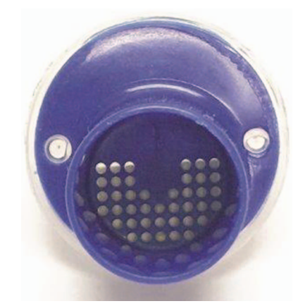
Fig. 4. On-end view of the tiny holes gas travels through in the Neo-StatCO<sub>2</sub> ETCO<sub>2</sub> detector.

In addition to enough contact time, adequate tidal volume is necessary to create a recognizable color change in colorimetric ETCO<sub>2</sub> detectors. A device with a larger dead space volume may require larger tidal volumes to show a color change than one with a smaller dead space. Small volumes may get washed out in the dead space of the device, producing a false negative result.<sup>1,11</sup> The Neo-StatCO<sub>2</sub> is the first colorimetric detector labeled for in-