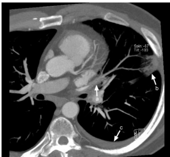
Fig. 1. This chest computed tomogram shows (a) new thrombosis of the lingular branch of the pulmonary vein, (b) pulmonary infarction, and (c) small pleural effusion.

tion of the lingula, and a stable approximately 50% stenosis of the left superior pulmonary vein. There was no evidence of filling defects in the pulmonary arteries.