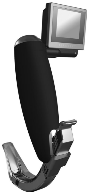
Fig. 9. The McGrath video laryngoscope.