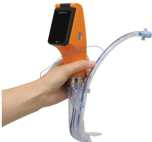
Fig. 4. The Pentax AWS.