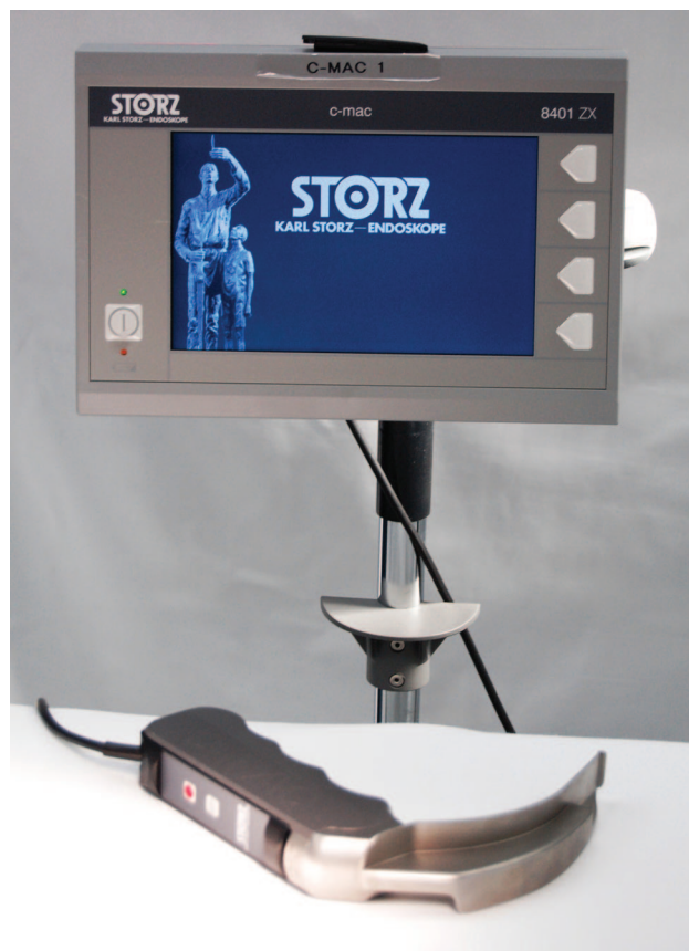
Fig. 8. The Storz C-Mac video laryngoscope.

scopic video imaging systems (Fig. 7). 3 Miller and Macintosh blades in pediatric and adult sizes are available. Sterile processing of the blade is necessary after use. The camera's electronics are incorporated into the handle of the laryngoscope. The angle of view is 60°. A high-resolution (15,000 pixel) image is viewed on an external monitor, which simplifies shared viewing and teaching. Kaplan and co-workers examined 865 intubations using traditional laryngoscopy compared with the Storz video laryngoscope. While both techniques provided good conditions in 85% of patients, they reported that the video system provided a better view in 12%. Direct laryngoscopy provided a better view in only 1% of cases. 30 Jungbauer and colleagues randomized 200 patients with Mallampati scores of 3 or 4 to receive traditional laryngoscopy or video laryngoscopy with the DCI. The video technique produced better visualization of the glottis, a higher success rate, and shorter intubation time, compared to direct laryngoscopy. 31 In pediatric patients, Vlatten and colleagues compared the use of the DCI laryngoscope to stan-