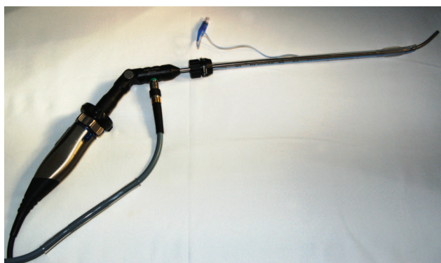
Fig. 1. The Bonfils intubating stylet with video camera attachment.