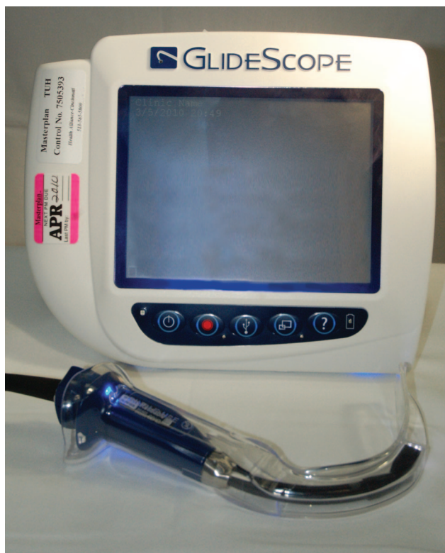
Fig. 11. The GlideScope Cobalt AVL video laryngoscope.

scopic view with GlideScope was equal to or better than that with direct laryngoscopy. 44 The average time required for tracheal intubation, however, was longer with the GlideScope (36 s vs 24 s). Serocki and co-workers compared direct and video laryngoscopic (DCI and GlideScope) views of 120 patients with at least one predictor for difficult intubation. 45 They reported a Comack view \geq 3 in 30% with direct laryngoscopy. The incidence was reduced to 11% with either the DCI or the GlideScope. The laryngoscopic view was improved with the DCI in 64% of cases, and in 94% with the GlideScope. Intubation was unsuccessful in 10% with direct laryngoscopy, but only in 2.5% of cases with the DCI or GlideScope.