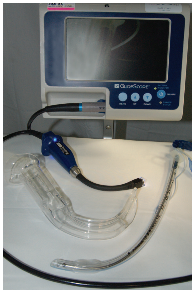
Fig. 10. The GlideScope Cobalt GVL video laryngoscope. The disposable plastic blade snaps onto the reusable video bundle. The "hockey stick" stylet generally facilitates passage of the endotracheal tube.

The GlideScope (Verathon, Bothell, Washington, http://www.verathon.com/glidescope_index.htm ) uses a plastic blade curved to a 60° angle to visualize the glottis. 39,40 Several different models are available: the GVL and Ranger have reusable blades; the Cobalt, Cobalt AVL, and Ranger Single-Use have disposable clear plastic blades that fit over a flexible video bundle. All use a CMOS camera chip with an anti-fogging mechanism and an LED light source. The image is displayed on a separate view screen. The GVL and Cobalt (Fig. 10) use a 7-inch 320 × 240 monitor, which also has a video-out port. The Cobalt AVL has a higher-resolution camera, a 6.4-inch VGA (640 × 480) monitor, and is capable of recording images in MPEG4