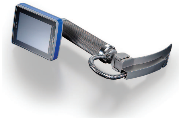
Fig. 6. The Coopdech C-scope.

The Res-Q-Scope II is a similar 2-piece device (Fig. 5). The main unit contains a color LCD view screen with a video-out port and rechargeable battery (a backup battery