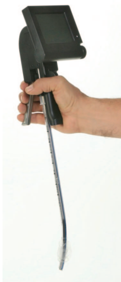
Fig. 2. The Video RIFL (rigid and flexing laryngoscope).

airway_management.aspx), and the Res-Q-Scope II (Res-Q-Tech, Humble, Texas, http://www.res-q-tech-na.com ). These devices hold an ETT within a guide channel. Image and light bundles run alongside the channel. The laryngoscopes can be inserted in patients with reduced mouth opening. Also, the