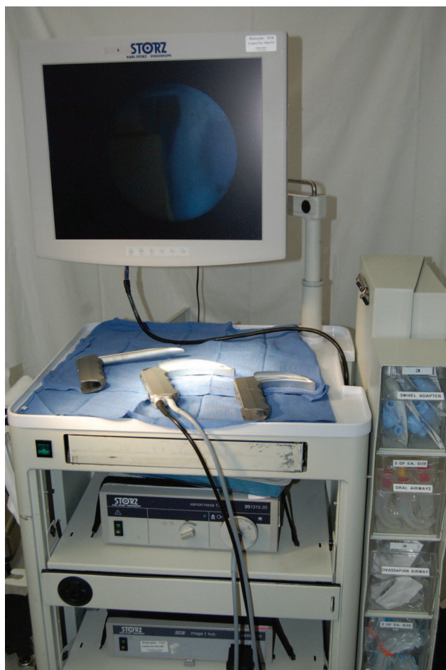
Fig. 7. The Storz Berci-Kaplan DCI video laryngoscope with difficult airway cart and external monitor. The cart contains the laryngoscope's light source and camera electronics.

scopic video imaging systems (Fig. 7). 3 Miller and Macintosh blades in pediatric and adult sizes are available. Sterile processing of the blade is necessary after use. The camera's electronics are incorporated into the handle of the laryngoscope. The angle of view is 60°. A high-resolution (15,000 pixel) image is viewed on an external monitor, which simplifies shared viewing and teaching. Kaplan and co-workers examined 865 intubations using traditional laryngoscopy compared with the Storz video laryngoscope. While both techniques provided good conditions in 85% of patients, they reported that the video system provided a better view in 12%. Direct laryngoscopy provided a better view in only 1% of cases. 30 Jungbauer and colleagues randomized 200 patients with Mallampati scores of 3 or 4 to receive traditional laryngoscopy or video laryngoscopy with the DCI. The video technique produced better visualization of the glottis, a higher success rate, and shorter intubation time, compared to direct laryngoscopy. 31 In pediatric patients, Vlatten and colleagues compared the use of the DCI laryngoscope to stan-