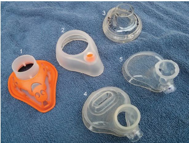
Fig. 2. Masks used in the study (small sizes shown). 1: Vortex. 2: AeroChamber. 3: OptiChamber. 4: SootherMask. 5: InspiraMask.

Mask) to 43.1 mL (Vortex) for the small masks and from 41.7 mL (SoothingMask) to 71.5 mL (AeroChamber) for the medium masks. Measurements of the same mask using the water displacement technique were significantly higher ( P < .01 ) than those using the electronic technique. The variance was also significantly higher ( P < .001 ) for the water displacement measurement (mean of 2.3%) compared with the electronic V_D (mean of 0.5%).