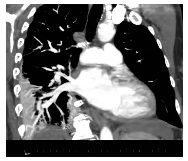
Fig. 1. Initial computed tomography showing dilated pulmonary vasculature, especially in the right lower lobe. There is evidence of atelectasis in the right lower lobe.