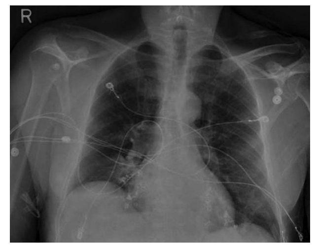
Fig. 3. Post-embolization chest radiograph indicating coil embolization in the bilateral lower lung fields.

multiple vascular coils in the lower lobes with no parenchymal changes (Fig. 3).