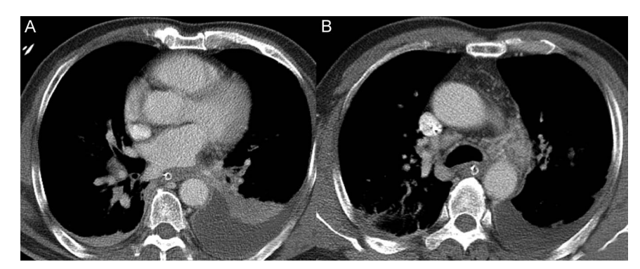
Fig. 2. A: Chest computed tomography showed near total occlusion of the left inferior pulmonary vein. B: Variceal dilatation, congestion, and edema formation secondary to pulmonary vein obstruction were also noted.

revealed findings indicative of adjacent variceal vascular dilatation caused by pulmonary vein stenosis (Fig. 2).