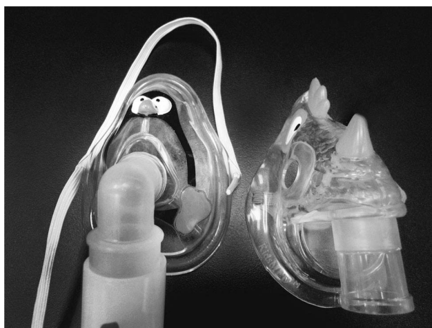
Fig. 2. The OxyKid mask (left) and the Dragon mask (right).