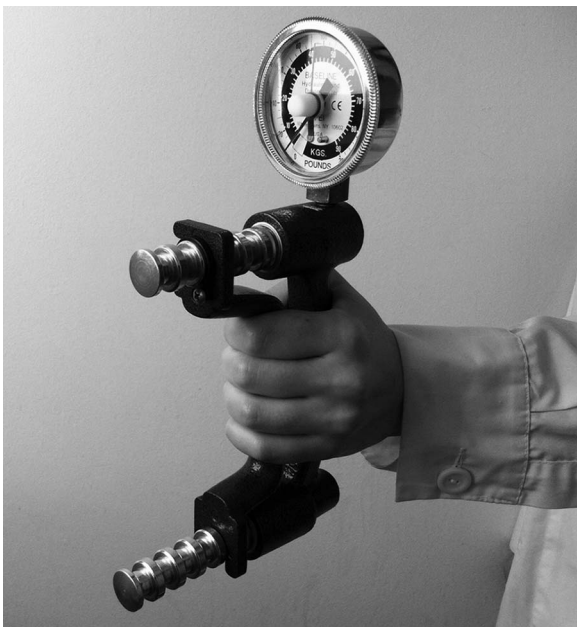
Fig. 2. The hydraulic gauge for hand-grip force, measurement in kg.

Covariates included in the univariable and the multivariable models were either binomial (sex, physical exercise, smoking status) or continuous variables (age, weight, height, BMI, hand-grip force). In the univariable models, a criterion of P \leq .10 was used to identify candidate predictors. Then we fitted a multivariable model and used a backwards selection procedure to eliminate those variables not significant in the multivariable framework. We used a criterion of P \leq .05 for determining which ones to eliminate. The beta coefficients derived from linear regres-