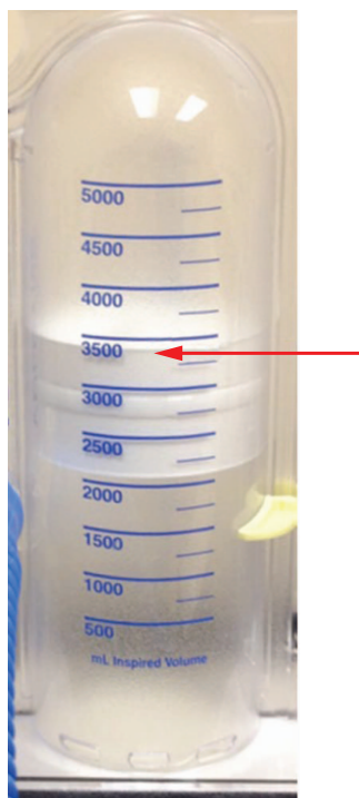
Fig. 3. Inspiratory volume measurement (red arrow).

there were significant increases between inspiratory volumes during the covered condition: group A ISV_S of 1,614.3 mL versus group A ISV_C of 1,839.3 mL ( P = 0.0068 ); and group B ISV_S of 1,613.1 mL versus group B ISV_C of 1,898.8 mL ( P = .009 ). The subjects in groups A and B had mean increases of 225.0 and 285.7 mL, respectively, under the covered condition. However, there was no statistically significant difference in performance improvement between the groups (225.0 vs 285.7 mL, P = .63 ). Of note, subjects in group A performed IS under the covered condition first; thus, the \Delta ISV in this subgroup represented a 225.0 mL decrease in inspiratory volume when incentive spirometers was repeated with standard exposure. Although the subjects in both groups showed improved inspiratory volume when the flow indicator was covered, there was no statistically significant difference in mean \Delta ISV of group A versus group B (225.0 vs 285.7 mL, P = .63 ).