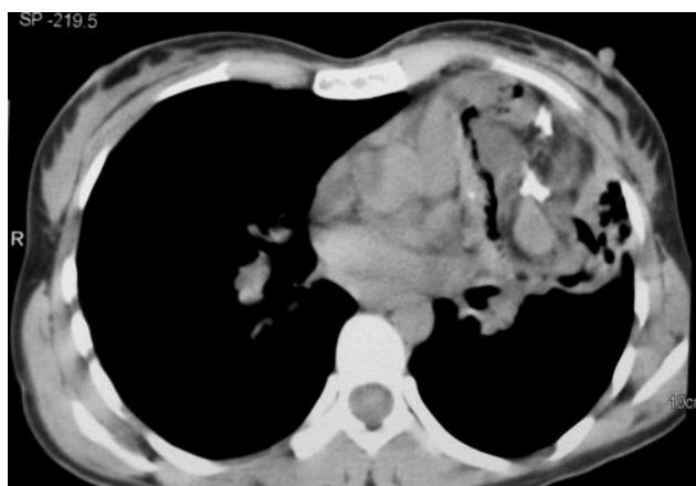
Fig. 1. Computed tomogram showing a heterogeneous mass lesion in the left upper lobe, with calcification, fatty tissue, and solid and cystic components.