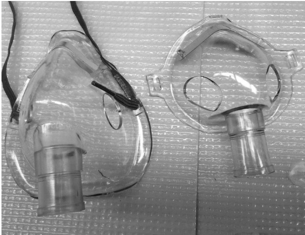
Fig. 1. Masks used in the study.