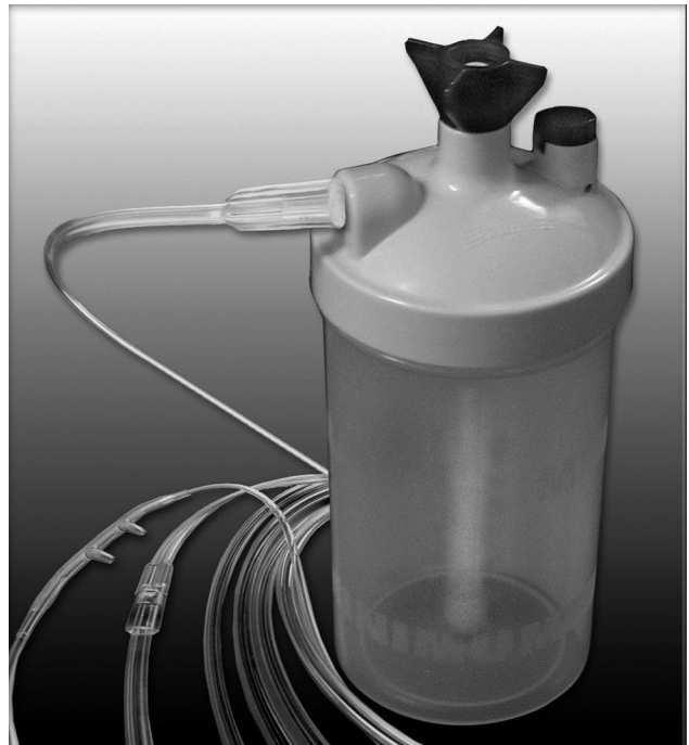
Fig. 1. The Salter Labs high-flow cannula and humidifier combination (Courtesy Salter Labs, Arvin, California).

Humidity measurement of moving gases near 100% relative humidity requires special measurement considerations, such as matching sampling equipment temperature to gas temperature and avoiding condensation on the hygrometer probe. Our measurements were performed using a new digital psychrometer/thermohygrometer (Mannix, Lynbrook, New York) that has a specified accuracy of \pm 1^\circ\text{C} and \pm 4\% relative humidity when humidity is > 90%. Factory calibration was confirmed in the laboratory, using a calibration salt. Humidity and temperature measurements were made at 5, 10, and 15 L/min, with 60 min between each measurement run. Four new Salter Labs cannula humidifier units (Fig. 1) and 4 new VapoTherm humidifier cartridges (Fig. 2) were each measured once to generate a mean value and a standard deviation for each device. Measurements were recorded when a stable reading was obtained per the manufacturer's instructions to wait until the measurement reading remained stable for 5 s. Between each measurement the hygrometer probe was exposed to dry oxygen gas flow until a zero percent humidity reading was observed, to ensure that the probe was dry before the