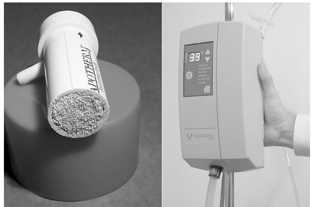
Fig. 2. Left: Cross section of VapoTherm humidifier cartridge. Right: Frontal view of the VapoTherm 2000i.

next measurement. A short, U-shaped silicone tube of approximately 2.5 cm inner diameter served as the sampling chamber and to slow the gas, to stabilize readings (Fig. 3).