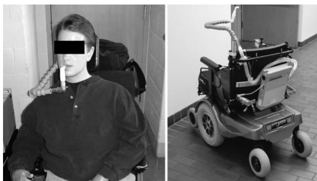
Fig. 1. Mouthpiece ventilation. Left: Patient with mouthpiece and ventilator circuit in standard position. Right: Rear view of wheelchair with ventilator and mouthpiece circuitry in place.