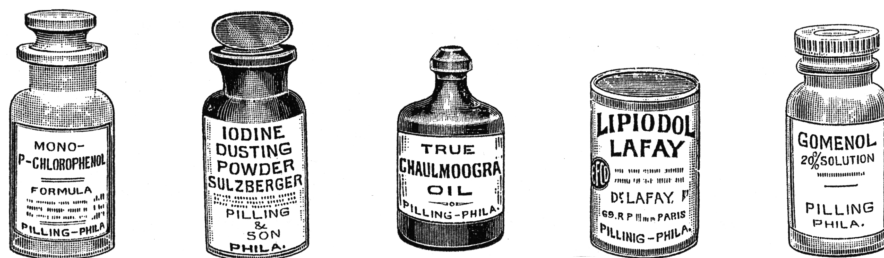
Medicinal Preparations and other substances for bronchoscopy and other respiratory procedures From George P Pilling & Son. Pilling Eye, Ear, Nose, Throat and Bronchoscopic Instruments and Equipment Philadelphia: The Company, 1932.