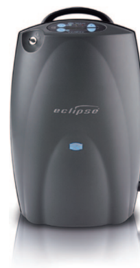
Fig. 5. This portable oxygen concentrator can operate in either continuous-flow (0.5–3 L/min) or pulse-dose mode (settings 1–6).

At one end of the continuum we have sedentary use, where the majority of daily LTOT use occurs. At this point in the continuum, patients are typically at home, generally resting and occasionally performing various, non-stressful domiciliary activities of daily living such as personal hygiene, meal preparation, and possibly even light house-keeping. Systemic oxygen demand is at its lowest at this point on the continuum, and, accordingly, the amount of supplemental oxygen required to ensure adequate saturation is likewise at its lowest.