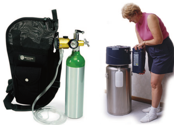
Fig. 2. Left: Standard portable gaseous-oxygen cylinder with oxygen-conserving device. Right: Refillable portable liquid oxygen canister.

An important consideration when using any oxygen-conserving technology is to ensure that the delivered bolus of oxygen is sufficient to maintain the same degree of oxygen saturation that was attained with the physician's original continuous-flow prescription. A common misperception is that a numerical setting on a particular OCD (eg, 1, 2, 3) is equivalent to the numerical settings on an oxygen flow meter. They are not at all equivalent. 27,28 The numerical settings on an oxygen flow meter denote L/min of continuous flow, whereas