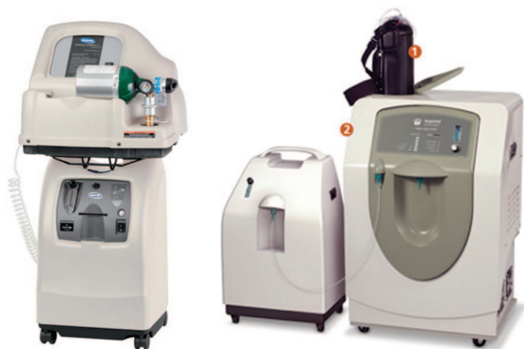
Fig. 3. Left: Concentrator that transfills a gaseous cylinder. Right: Liquefier that transfills liquid oxygen canister. (Inspired Technology, North Huntingdon, Pennsylvania).

the fact that the home-care provider no longer has to make periodic home deliveries to replenish depleted gaseous or LOX contents. 27 A non-delivery LTOT device is self-sustaining—capable of producing ample oxygen to effectively provide for both stationary and ambulatory needs. This new approach makes the LTOT user relatively self-sufficient in terms of in-home use, ambulation (both within and outside of the home), mobility, and overall lifestyle. Home oxygen providers are also finding that non-delivery LTOT technology can be a very cost-effective alternative to the expense of maintaining traditional stationary and portable systems with repeat home deliveries.