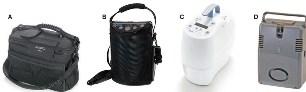
Fig. 4. Four models of pulse-dose-only portable oxygen concentrator.

the same system, suggesting that carrying a portable oxygen system might not be appropriate for all patients, regardless of the weight of the device. At this writing, there is only one POC capable of operating in either the continuous-flow or pulse-dose mode (Fig. 5). No doubt as non-delivery technology continues to evolve, we will see further additions to this type of LTOT device.