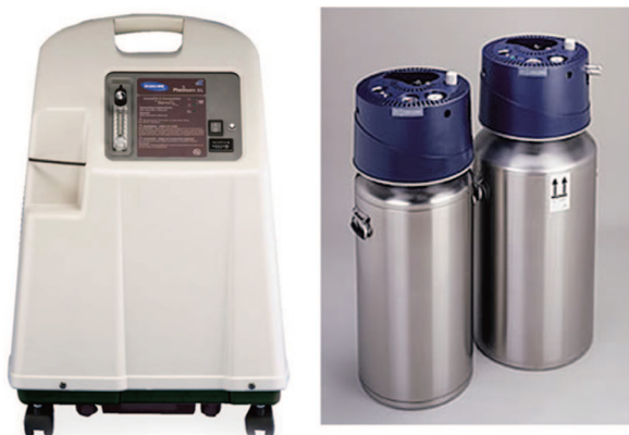
Fig. 1. Left: Standard oxygen concentrator. Right: Two liquid-oxygen (LOX) dewars.

The most common approach is the use of small, light-weight aluminum gaseous-oxygen cylinders (size M-6) that are usually carried or, if need be, can easily be pulled on a cart. However, with smaller cylinders, especially if they are light enough to be carried, there is the tradeoff of limited oxygen capacity. For instance, a patient with an LTOT prescription of 2 L/min will deplete an M-6 cylinder having a total capacity of 164 L of gaseous oxygen in little more than one hour. One way to extend the amount of time away from the stationary system would be to use a larger vessel, such as an aluminum E cylinder having a capacity of 622 L of gaseous oxygen. At 2 L/min, a full E cylinder would last approximately 5 hours. However, an E cylinder with cart and regulator weighs in excess of 20 pounds, making this portable system unwieldy and extremely difficult to maneuver. This contrasts sharply to the aforementioned M-6 cylinder, which, including regulator, weighs less than 5 pounds and is easily carried.