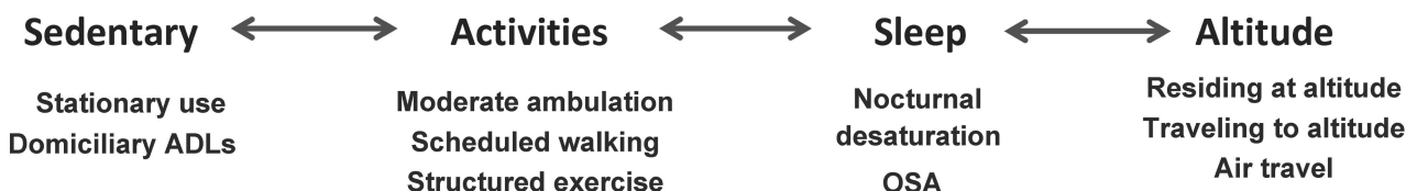
Fig. 6. The long-term oxygen therapy continuum. The primary clinical objective is to ensure adequate oxygenation/saturation ( S_{pO_2} \geq 90\% ) across the entire LTOT continuum at all times .

Whether it is United States Pharmacopoeia grade, as is most often found in institutional settings, or concentrated,