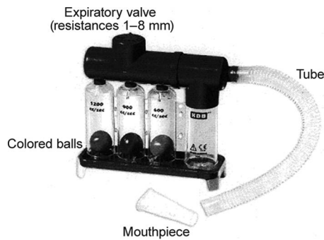
Fig. 1. The Tri-Gym handheld device.

intervention on spirometry measurements for each subject on both techniques.