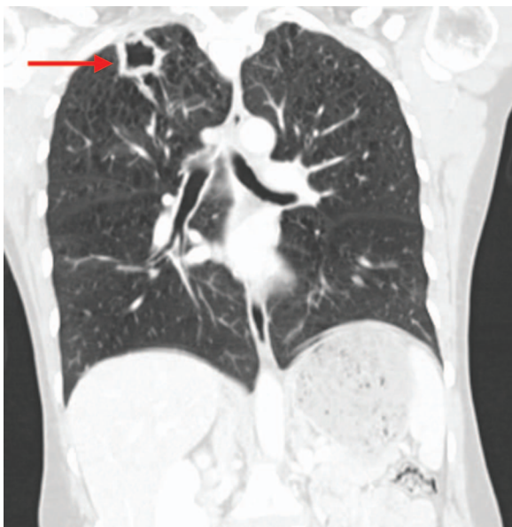
Fig. 2. Initial coronal computed tomography scan showing right upper lobe cavitory lesion (arrow).