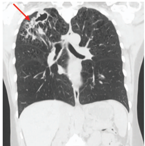
Fig. 4. Coronal computed tomography scan after 2 y showing inferolateral spiculated irregular density originating from the cavity (arrow).

unchanged for 18 months. Repeat cultures at 6, 12, and 18 months were negative.