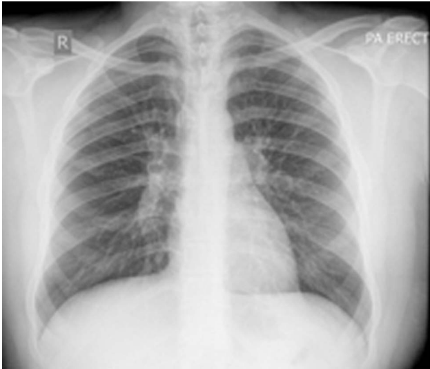
Fig. 1. Initial presenting chest radiograph. This was reported as normal.