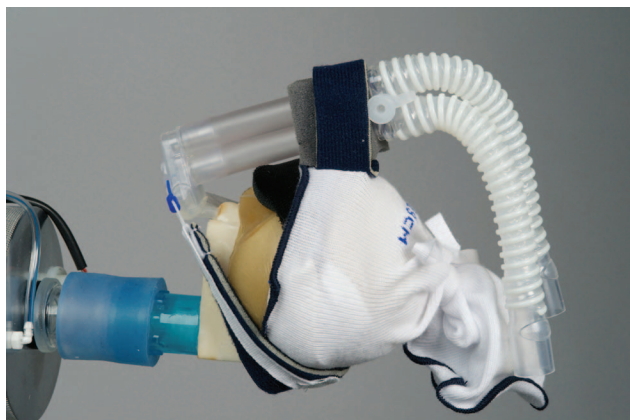
Fig. 1. Validated nasal model attached to the foam craft ball to construct a physical model with which a size 25–29-cm Fisher & Paykel bonnet would snugly fit.

The RAM cannula size (newborn RAM cannula) recommended by the manufacturer for the naris model delivered slightly less than half of the set pressure across all of