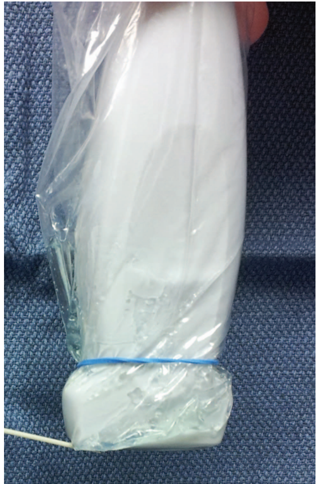
Fig. 1. Example of an ultrasound probe prepped for use.

In our institution, RTs certified in radial artery catheter placement complete a bedside training session lasting approximately 30 min while being proctored by an emergency medicine physician or RT trained in ultrasound-guided arterial catheter placement. The training session includes: ultrasound machine operation, identification of the radial artery, demonstration of the transverse and longitudinal methods, proper sterile technique, and proper left-hand technique to prevent probe movement during attempts. RTs are encouraged to perform arterial puncture with ultrasound guidance and to observe central venous catheter placement or peripheral intravenous placement under ultrasound guidance to improve their understanding of the technique. During their initial attempts, the precep-