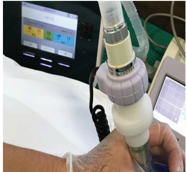
Fig. 2. Connection of the spirometer (Minato) and mechanical insufflation-exsufflation device (Philips Respironics).

Regarding the connection method, a flexible tube was connected to the MI-E device, the transducer of the automatic spirometer was connected, and a mask was connected. The peak expiratory flow output from the automatic spirometer was recorded as CPF(s), and the CPF on the MI-E display was recorded as CPF(m). Without using an airway pressure meter for MIC measurement in MIC-CPF and MIC+assisted CPF, we pressurized a bag-valve-mask until subjects could not inhale further. The examin-