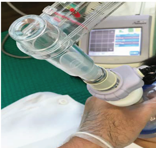
Fig. 1. Connection of the spirometer (Minato) and peak flow meter (Philips Respironics).

obtained using the peak expiratory flow output from the spirometer and the value from the peak flow meter. For the measurement of MI-E-CPF and MI-E+assisted CPF, an automatic spirometer and MI-E (Cough Assist E 70, Philips Respironics) were connected (Fig. 2).